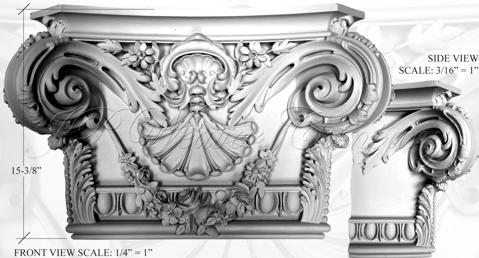
SIDE VIEW SCALE: 3/16" = 1"