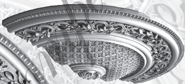
ANGLED VIEW NOT TO SCALE